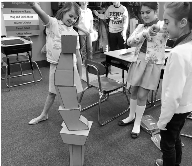
Figure 1: Elementary Students build towers out of pre-made, odd-shaped blocks that encourage learning lessons related to equilibrium, balance, center of gravity, and scale.

The students were split up into small groups and each given the same set of 6 cardboard boxes. Each box in the set varied in shape, size, and weight. We used the blocks as a teaching tool for two different exercises. In exercise one, the students explored equilibrium, balance, and center of gravity. Given a range of requirements to follow, they were challenged to build block towers as tall as possible. In Exercise two of the Tower Challenge, each group selected one student as the designer. Unable to touch the blocks, they needed to communicate their design idea to their fellow "builders." Each group was given a large sheet of plotter paper and a set of markers. They were instructed to draw the tower at real scale with no measuring devices. They used their hands to measure lengths and angles of blocks, then draw the tower's elevation on their papers.