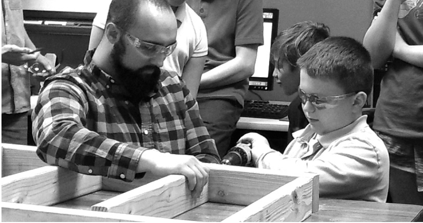
Figure 3: A university student displays skills-based learning by demonstrating and teaching methods of constructing a stud wall.

Affective Goals are described such that a student demonstrates a willingness to participate; seeks out an opportunity to engage a subject, and adopts a long-term value system related to the subject. These indicators are expressed by each university student through the willingness and initiative that is necessary to take part in the Independent Study. It is not a required course, and therefore it is necessary to seek out enrollment and be an active contributor. Student responses in part 3.3 can more directly attest to a long-term appreciation of the experience.