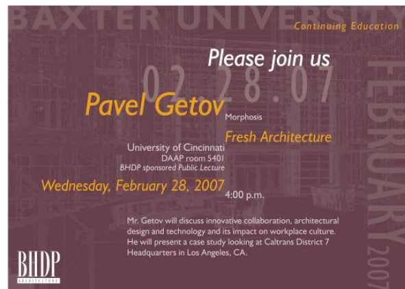
Figure 3: Baxteru marketing of public lectures (BHDP, 2006)

Given the range of offerings, participation is weak. All BHDP leadership are not fully engaged as teachers or participants. At times some of the leadership questions the value of education and dialogue. The firm also does not promote or communicate information about in-house or public lectures in recruitment material, on the firm website, or in general marketing material.