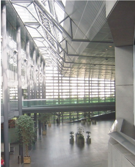
Figure 4: Grenoble Courthouse, 1994-2002. Breathable facade. Single-glazed outer skin, 40 mm (1.5 in) wide air space, double-glazed IGU inner skin.

air space and the exterior, thus preventing condensation in the cavity (Fig. 5). Glazing here is also clear low-iron. Solar control is provided by fixed external metal louvers. As discussed in Section 4 below, application of breathable facade technology required (and still requires today) technical review by an agency that works on behalf of the French government to support the emergence, development and safe use of innovative building technologies.