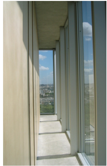
Figure 7: French National Library. Floor-to-ceiling wooden panels pivot to control light.