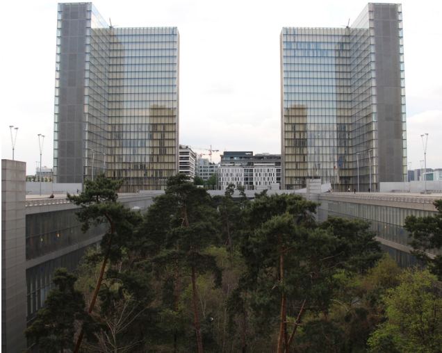
Figure 6: French National Library. Double-skin pressurized facade (CCF). Single-glazed outer skin, 90 mm (3.5 in) wide pressurized air space, double-glazed IGU inner skin.

Structural fabricated the facades for both landmark buildings, working in close collaboration with the buildings' respective architects and project teams to realize ambitious design visions.