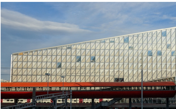
Figure 8: JTI Headquarters, 2015. Geneva, Switzerland. CCF facade. Single-glazed outer skin with tilted planes, variable depth air space, triple-glazed IGU inner skin. Overall unit depth 400 mm (16 in). Fabric roller blinds in the cavity.

While there are no completed CCF projects in the United States known to the author at this writing, the increasing practicality of unitized, thin-profile high performance facade systems is beginning to be recognized in this market. The National Institute of Building Sciences (NIBS) awarded Permasteelisa North America with a 2017 'Beyond Green' Honor Award for company's propriety CCF system. The "writing is on the wall" that CCF will soon be a first in North America.