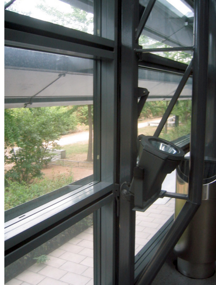
Figure 5: Grenoble Courthouse. Breathable facade. Small dust-filtering breathing holes in the bottom portion of the unitized aluminium frame.