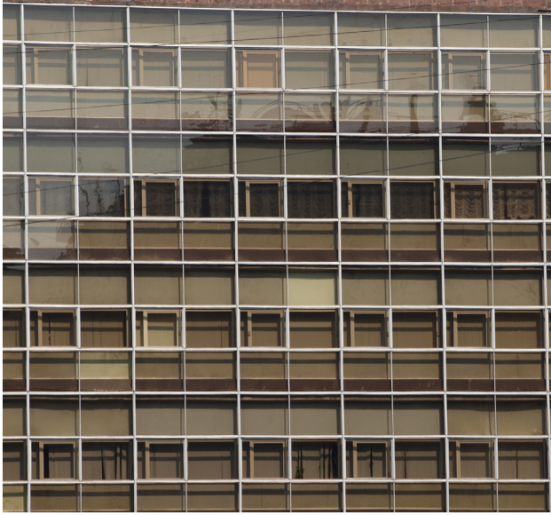
Figure 1: Centrosoyuz, 1928.