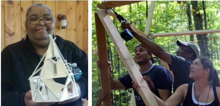
Figure 2: Joyful body language?

slightly. They begin to grin and even giggle spontaneously. Verbally, they might start spinning tales about what they could see themselves doing there (Fig. 2). This is an extremely subjective or qualitative observational technique, but which in my experience can be useful in situations such as this, where overt measurement techniques would be inappropriate. In consequence, I kept informal notes and images to capture such moments throughout the process.