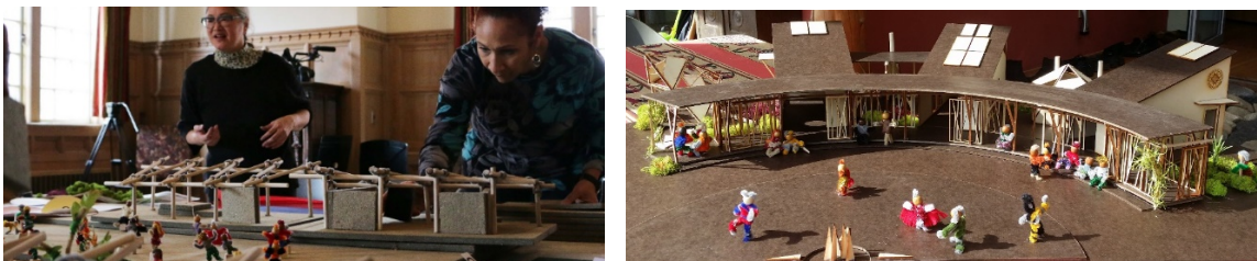
Figure 3: Scale Figure Workshop & Figures populating eventual design, Source: (Mighty, 2016)(Author, 2017)

Soon we had about 20 figures, and lots of useful information. A couple participants really got going and leaped into assembling the model's modules and to churn out scale garden plantings (Fig. 3). The activity focused people on making, so that information flowed unselfconsciously. Building to scale (we had tiny paper rulers) helped people imagine themselves in the scene while feeling like real participants in preparing a representation of their future project right at the get-go. The model itself was essentially a throw-away—a more attuned design would be developed with them later, and the scale figures and plants would populate the new model—nonetheless having scale model components there to 'play with' was key. In this case, the positive body language consisted of the enthusiastic making and handling of the scale figures and model parts, reinforced by lots of smiles and laughter. The chair heard afterwards that the participants loved the experience and wanted to do it again.