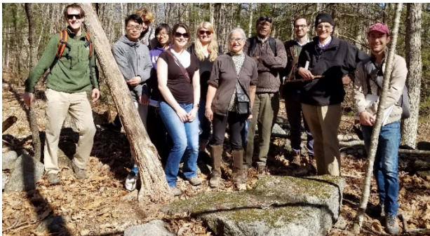
Figure 1: NCP Chair, donor, author, collaborators & students at indigenous formation on the land. Source: (Author, 2017)

Although all of this was good news, the Nipmuc Cultural Preservation Chair and I knew that we'd have to make sure that the top-down process driven by the donor and his priorities would not overrun the delicate process of developing within the Nipmuc community its own attachment to this remote piece of land, and the individual and collective will to move towards inhabiting it. Keeping this in mind, we were able over the course of the year to work through a multi-stage process with students and the Nipmuc community, including an informed study of the nearly 40-acre area of the two parcels, and development of a building and landscape design that can move the project towards fund-raising.