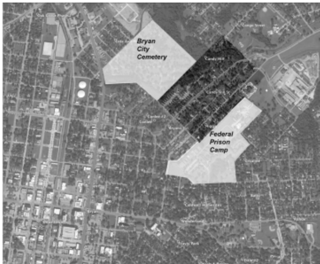
Figure 1. Candy Hill Neighborhood between the cemetery and prison camp. (Google earth V. 7.1.8.3036, (1/17/2017). Bryan, Texas, USA, 30° 40' 55"N, 96° 21' 96"W, Eye alt 7587 feet)

Median income in the Candy Hill neighborhood is $27,743.00 and 10% of the residents self identify as college educated. Over 70% of the housing in the neighborhood is owner-occupied and 63% of the residents are married. One-quarter of the residents make a commute to work of less than 25 minutes, and 60% of the unmarried population is Male. (Trulia, 2017) While the greater Bryan city area has a higher crime rate than the U.S. average, the Candy Hill Neighborhood reports few instances of criminal activity.