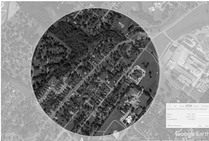
Figure 2. The 5-minute walk radius overlaid upon the Candy Hill neighborhood. (Google Earth V 7.3.1.4507. (February 5, 2018). Bryan, Texas, USA. 30° 40' 53.44"N, 96° 21' 38.28"W, Eye alt 2915 feet)

Figure 2 shows that a 5-minute walking radius easily encompasses the neighborhood. The next step might be finding a location for our proposed “parklet”. The center of the radius falls on the “New Direction Worship Center” on Martin Luther King Jr. Street. Two parking spaces near the Worship Center would be an ideal site for the “parklet” as there are no businesses nearby that might be concerned about competition and the Worship Center is already a community service type of organization. This possible “parklet” location is also on a low-speed street, 30 mph (48 KpH), and has a public sidewalk adjacent to the street. (See Figure 3)