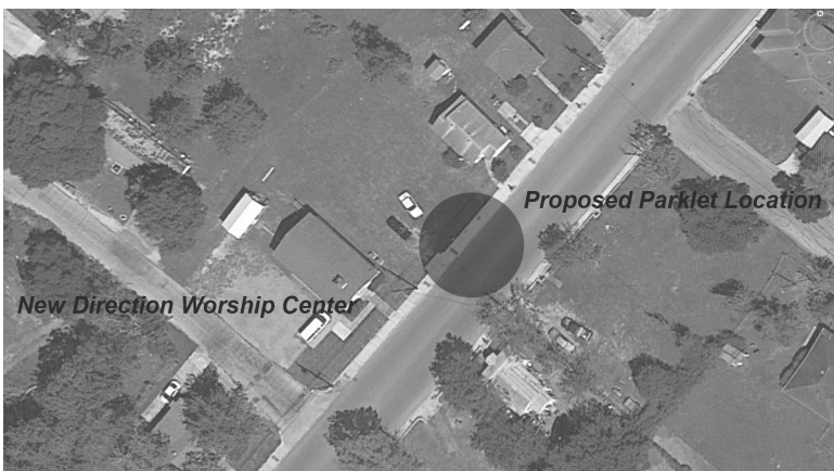
Figure 3. Possible Candy Hill Parklet location.

Drawbacks to the location are the shortage of shade, requiring some shading device or more substantial portable planters, and a nearby driveway that would have to remain unobstructed, but a two-parking space “parklet” would be physically possible on the site and is located near the heart of the neighborhood.